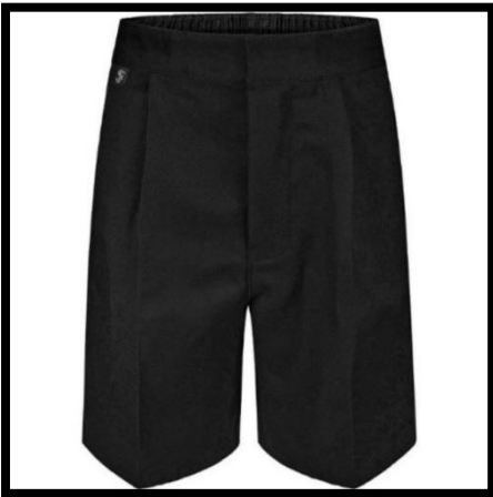
Example of tailored shorts (summer uniform)